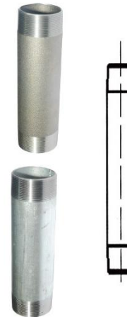
Note: Heavy-type as per above sheet

BRITISH STANDARD: BS EN10241 PIPE: BS1387,Medium&Heavy THREADS: ISO7/1 DIN STANDARD: DIN 2982 PIPE: DIN 2440,Medium&Heavy THREADS: DIN 2999